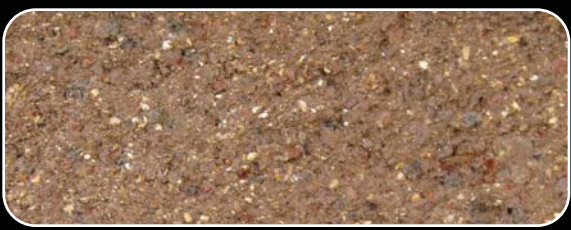
Landscape: Sedona Red