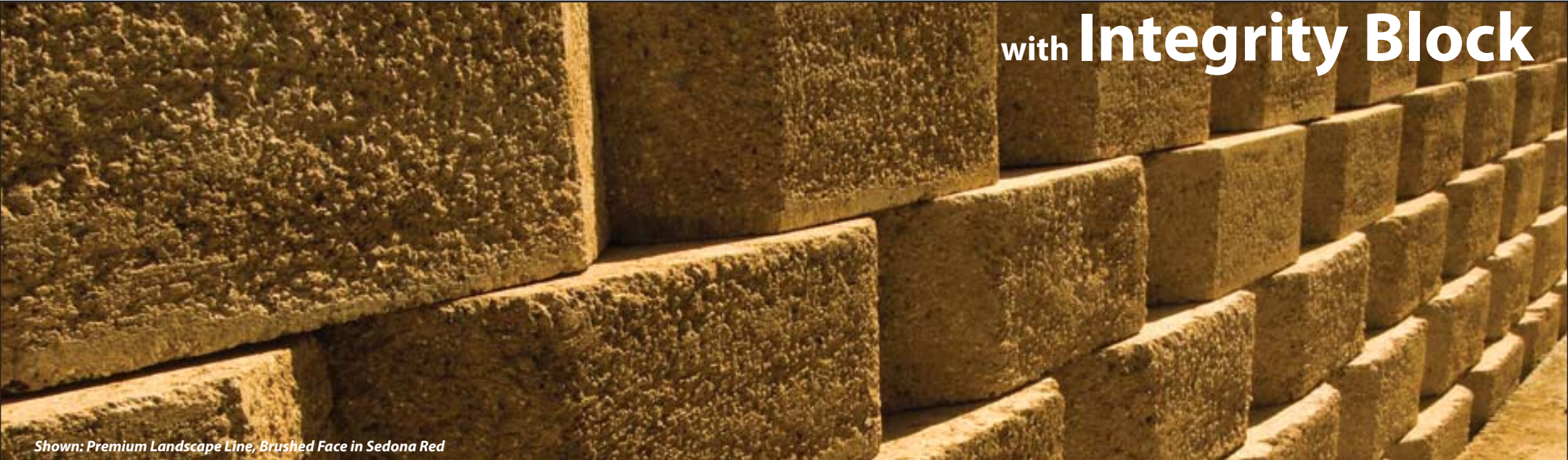
Shown: Premium Landscape Line, Brushed Face in Sedona Red