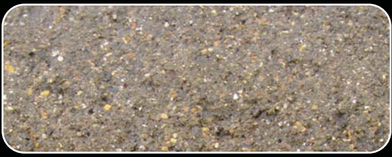
Landscape: Natural Brown

All Integrity Block products are made of a natural soils composite and although we have made best efforts to capture the colors in this brochure, colors may vary. We recommend reviewing color options in person for accurate representation.