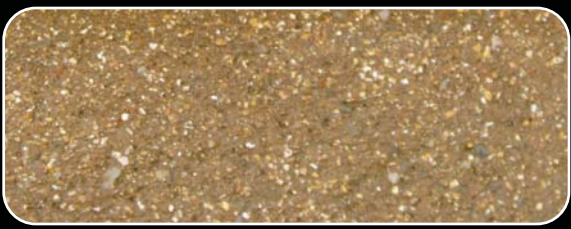
Landscape: Sahara Tan